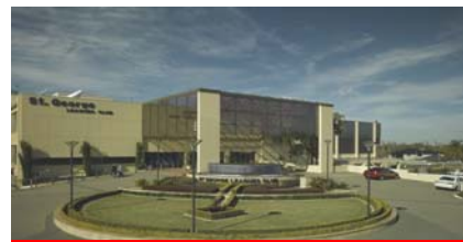
St George Leagues Club

Saturday 18th November 2017 at St George Leagues Club - RSVP 4/11/2017