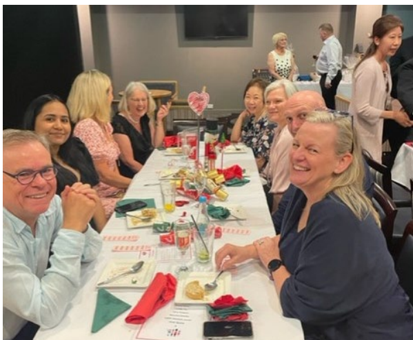
Nurses and Perfusionists from St George Hospital Cardio Thoracic unit